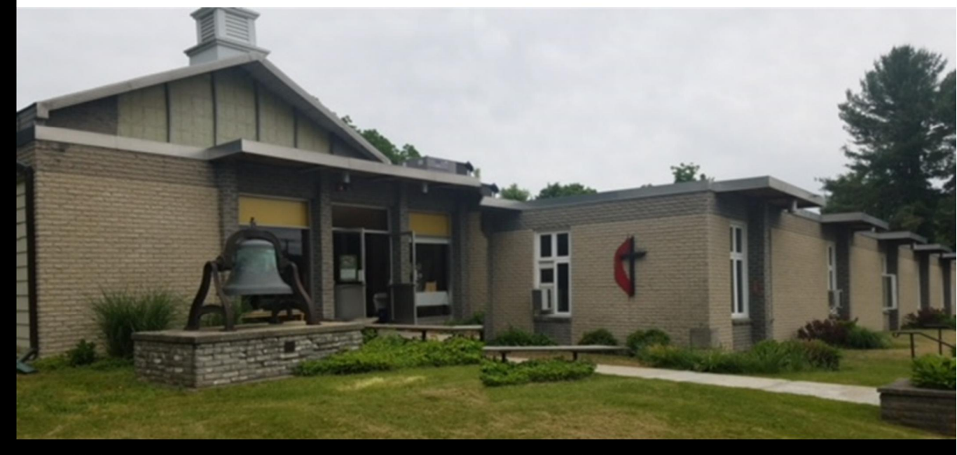
"Blessed are those who mourn, for they will be comforted." Matthew 5:4

Guidelines and Suggestions for Planning a Funeral Service